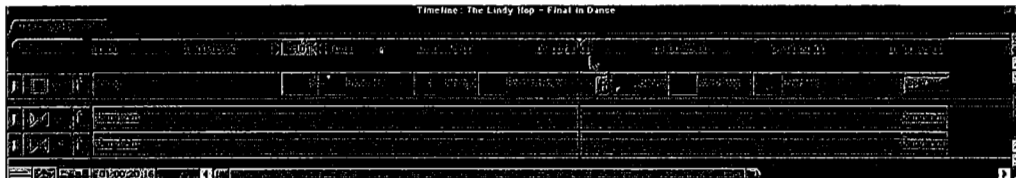
Figure 27.2. A typical time line. This example is taken from Apple Final Cut Pro. The position locator is represented by the long vertical line and yellow arrowhead near the center.

Multichannel video editing is also on the horizon not only as a new art and media form, but as a legitimate tool for presentation of multiple video channels; there is a relevance to studying distributed learning with video capture of interactions at each node of collaboration. Commercial editing tools have principally been developed for creating single-channel programs, for example, a linear film or video with one image stream accompanied by simultaneous audio in mono, stereo, or multiphonic variants. Although the semiprofessional and professional systems are capable of multiple video and audio tracks, these are intended as intermediary steps in creating the single-channel master. Layered video tracks are intended for creating composites, keys, and other image effects that will ultimately be reduced to one image track via rendering. The multiple audio tracks are likewise an aid in working with different sound elements such as speech, sound effects, and music that will be mixed down to the finished stereo audio