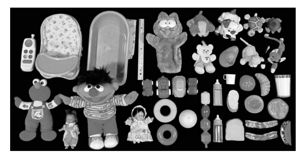
FIGURE 1 Toy objects presented by the Spanish-speaking tutors (with ruler included to show size).

gaze shift was calculated for each infant for each session, and averaged across the two sessions for the "gaze-shift proportion." A " face-only proportion," " toy-only proportion," and " look-away proportion" were similarly calculated. Rater agreement was determined by having an independent coder rate one session for each infant. The inter-rater agreement for infants' gaze behavior was excellent (Cohen's kappa = .81).