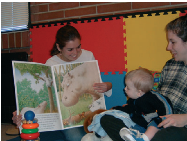
Figure 1 Example of a Spanish-language exposure session. Five native Spanish-speaking researchers (four female, one male) served as 'tutors' who used books (10 minutes) and toys (15 minutes) while talking to the infants. Each infant participated with at least three different tutors at least three times, for a total of 12 sessions. Infants' parent/caregiver accompanied them, and either one or two parent–infant dyads were present during the sessions.

Brain electrical activity was recorded using 32-channel Electro-Caps with tin electrodes arranged according to the International 10–20 system, with all leads referenced to the left mastoid electrode (off-line re-referencing used averaged activity from left and right mastoid electrodes). Electrode impedances were kept below 10 k \Omega . Signals were amplified at a gain of 20,000 within a bandpass of