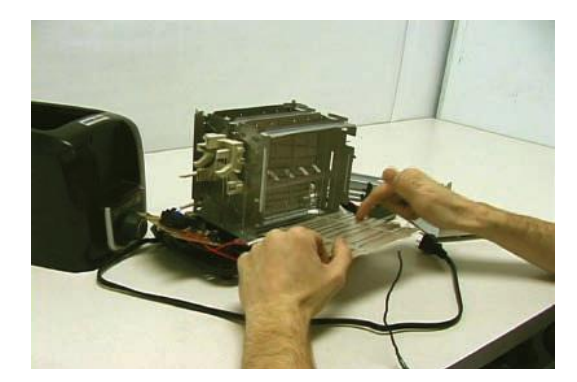
<u>Figure 1</u>. Instructional video shot as an IIT showing events from the expert's perspective (left) and the same event shot from the perspective of a passive observer (no camera movement) (right).