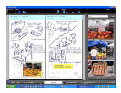
Figure 2. Left: Pages 1 and 2 from an Idea Log recoding observations during a Farmer's Market. Right: The same pages viewed in the ButterflyNet browser. Notebook pages with their photo and text annotations are presented in the left-hand content panel, while contextual data (e.g., related images, search results) are presented in the right-hand panel. Above, a timeline shows class milestones along with a bar graph visualization of the amount of notes collected on days throughout the quarter.